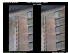
3D stereo measurement